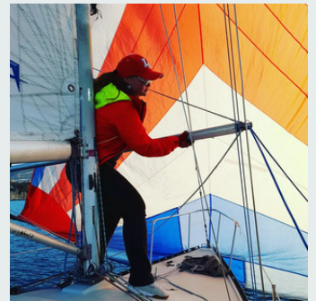
Spi / Docking maneuvers