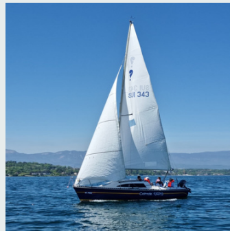
Monthly courses by level