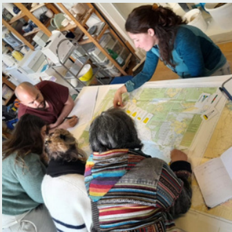
Nautical chart Weather forecast